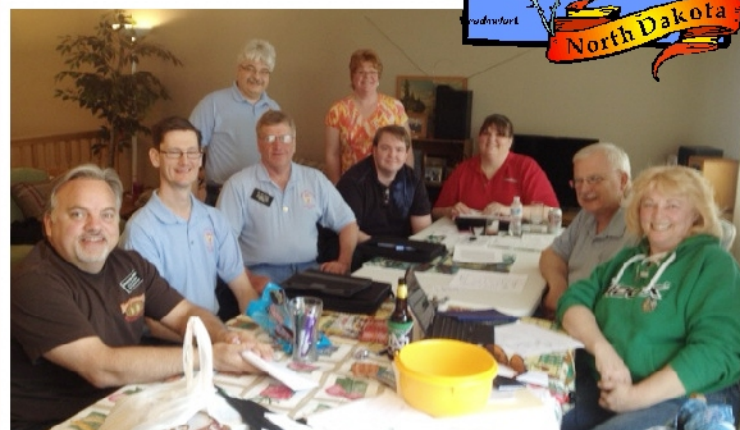
From the most recent meeting of the North Dakota JCI Senate.