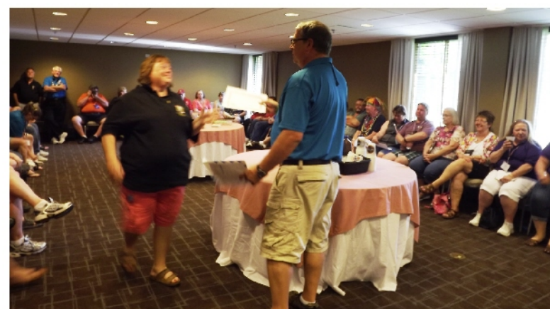
Region VI Meeting in Baltimore