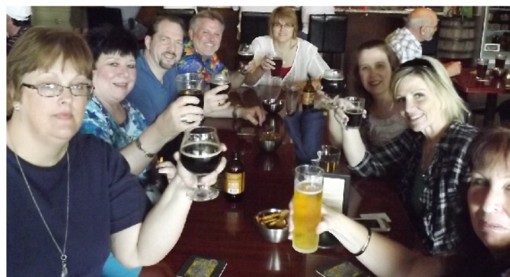
Enjoying a beer at the Peace Tree Brewery in Knoxville - Iowa JCI Senate Picnic 2014