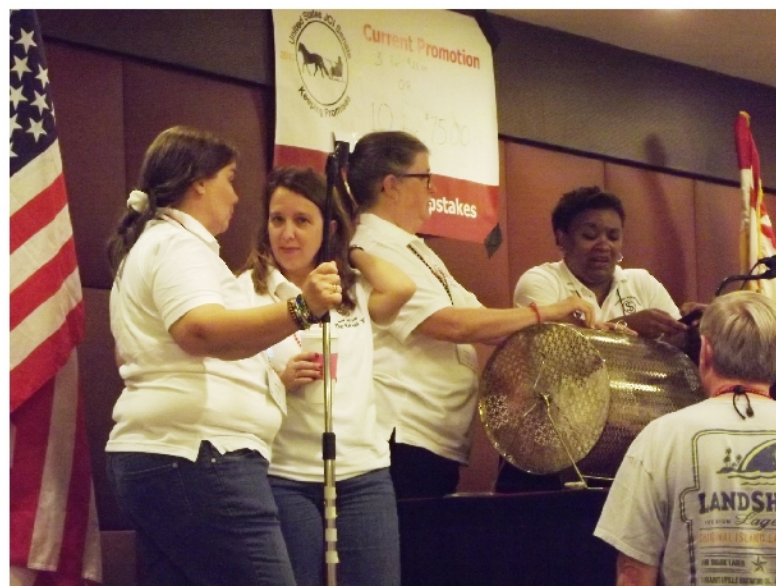
Presidential Sweepstakes Committee drawing of prizes.