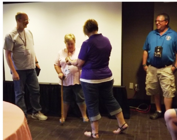
Region VI meeting at National in Baltimore