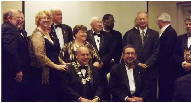
Get all the past USJCI Senate Presidents that you can together & try to get their attention....